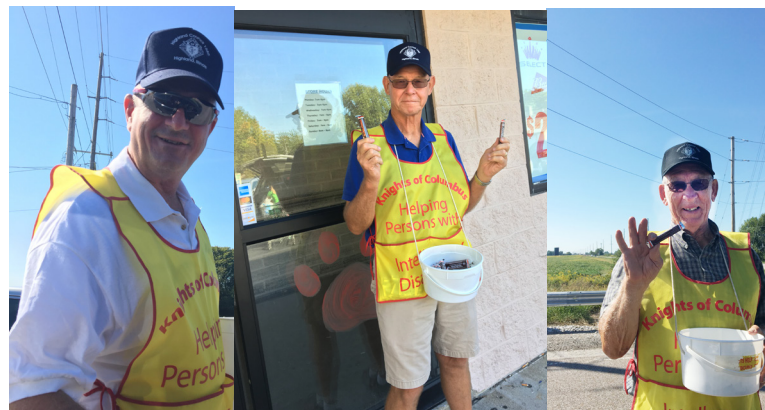
Members of the Knights of Columbus Council # 1580 were very visible recently as they took part in the “Campaign for People With Intellectual Disabilities” appeal.

previous page – kofcsafe then click submit. Make sure you have your membership ID number ready. The next page is the main registration page which requires all fields completed. Select the organization, change the state/province, choose volunteer, and then the user position – “Knight.” Complete all other questions and then “Click Here to Enroll.” Once enrolled, there are three courses to complete. Each course takes approximately 30 minutes. You can complete a course and if necessary log out and return at a later date to finish remaining courses. Upon completion you will be given the opportunity to print out a certificate.