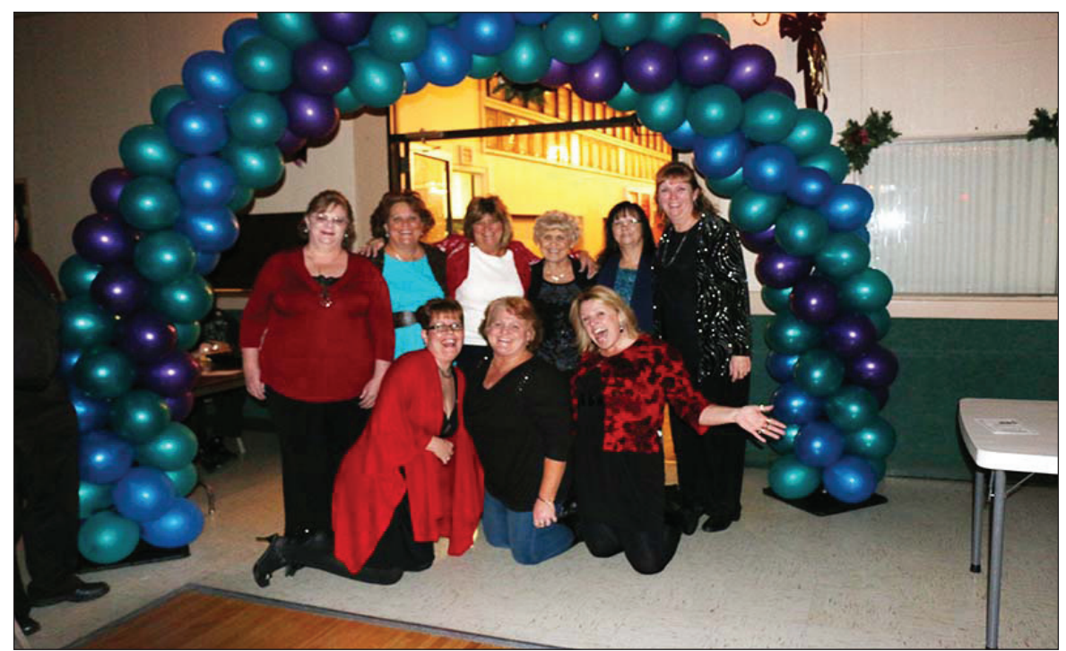
Lady Knights and friends celebrating New Year's Eve at the Annual KC Dance. Theevent was very well attended!