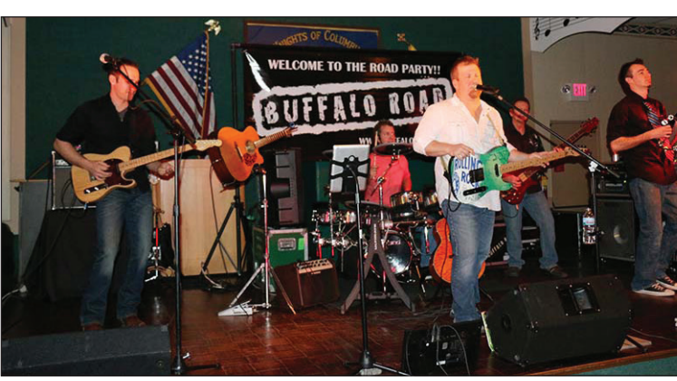
Buffalo Road does a great job performing for the Knights and guests.