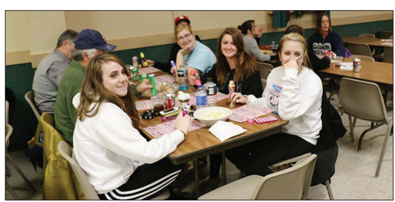
The KC's held a special New Years Day Bingo which was well attended by everyone, including college students visiting parents over the holidays.