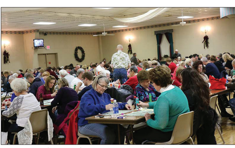
The community looks forward to the weekly Bingo games.