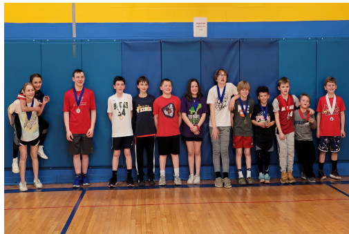
FREE THROW: Pictured left, participants practice shooting basketballs prior to the start of the event. Pictured right, are the winners of this years free throw.