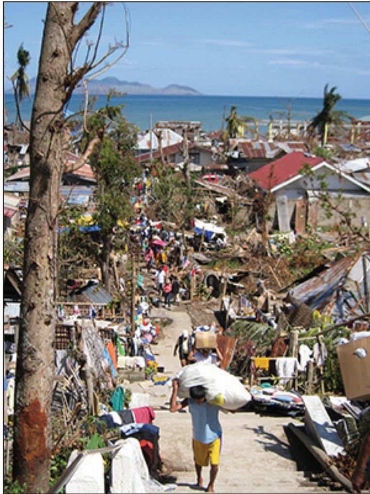
These are coastal areas hit by ocean surges that caused massive destruction.

Cebu City traveled to northern Cebu to distribute sacks of rice and canned goods.