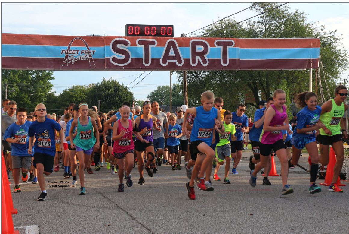
Pioneer Photo By Bill Napper

Read this bulletin on line at www.highlandkc.org