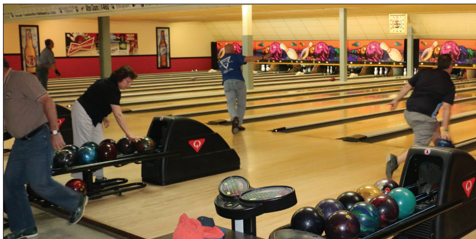
the 22nd Annual Springfield Bowl for Charity was a tremendous success.

Next year's event is already in the process as this helps our brother seminarians continue in their quest on the road to priesthood.