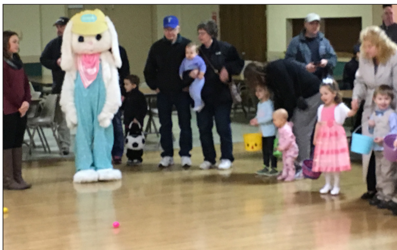
On your mark get set go!