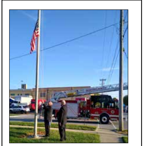
FOURTH DEGREE MEMBERS Herb Durring and Ed Campbell help kick off the Kirchenfest Strassenlauf run on August 27.