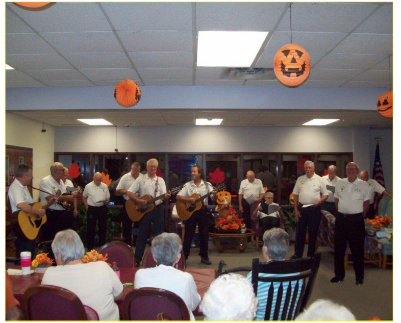
Knights Time Singers To The Pioneer Newspaper The Highland Knight Time Singers were guests at Faith Countryside Atrium Apartments recently where they performed all the hits from years gone by for the residents.