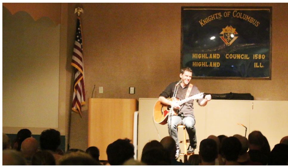
Songs of Love

"My family would watch TV and I would go into the my room to pray the rosary. It was through the rosary that I discovered who Jesus really is," he said.