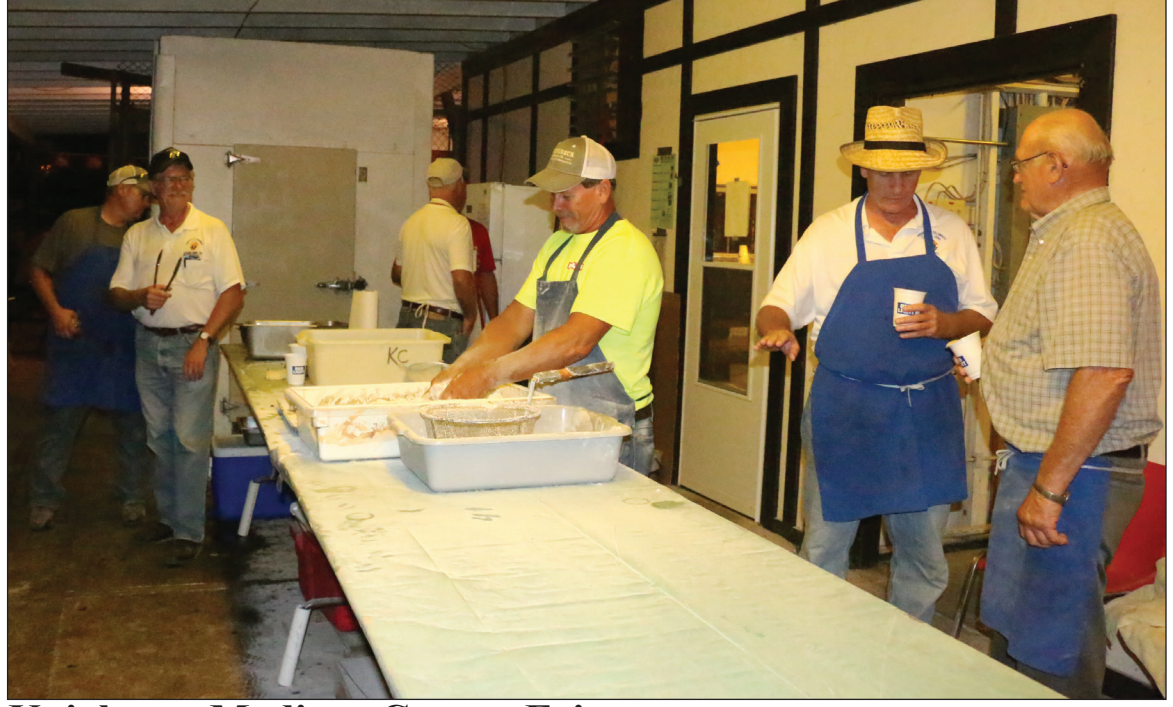
Knights at Madison County Fair

The Sir Knights of the Highland Assembly consider it a great privilege to honor their fellow Sir Knights with the Chalice program and Chalice Ceremony.