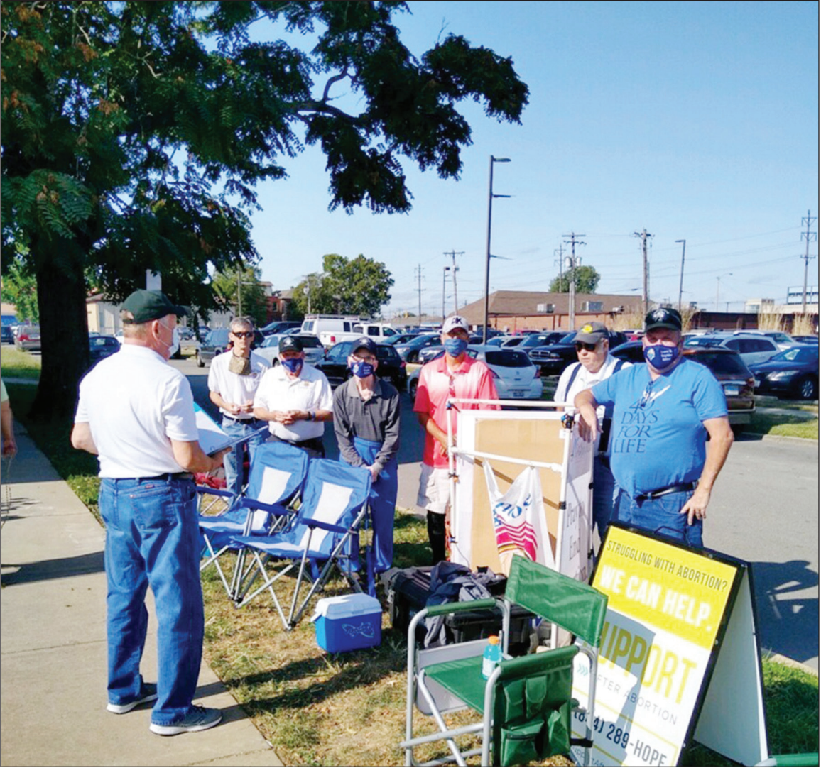
Prayer Highland Knights of Columbus lead prayers at the Granite City abortion clinic during the 40 Days For Life.

Read this bulletin on line at www.highlandkc.org