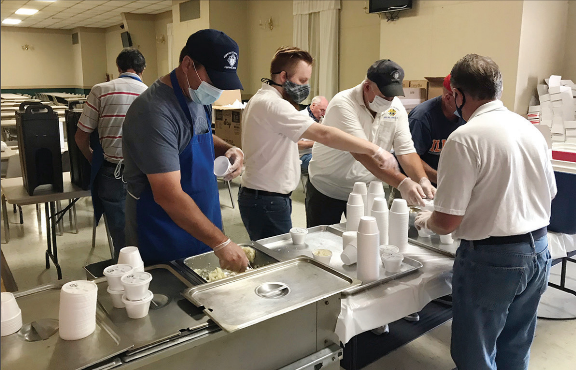
Chicken Dinner The Highland Knights of Columbus prepare a chicken dinner at the Knights of Columbus hall on Sunday, September 27. The dinner was a tremendous success.

Ask a Fellow Catholic To become a member of the Knights of Columbus Or join the Ladies Auxiliary!