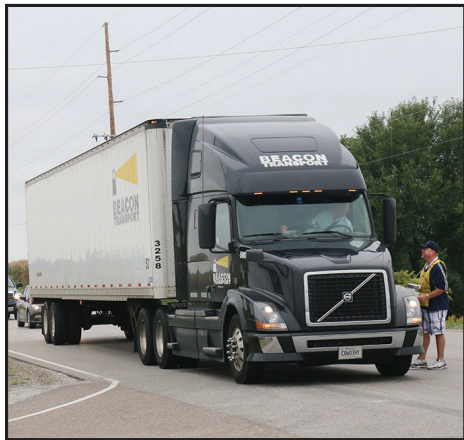
Thanks To The Many Contributors, the Disabilities Awareness Campaign Was Very Successful