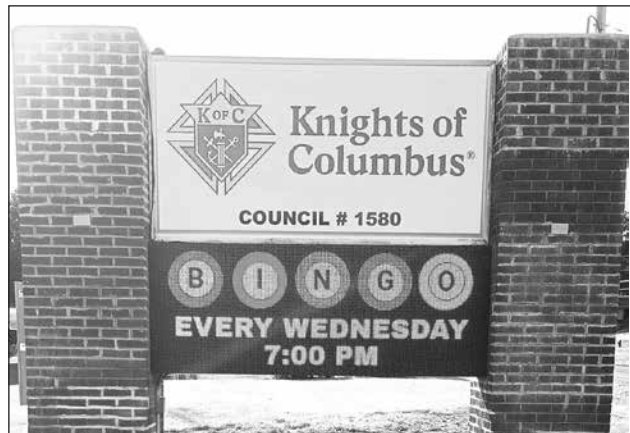
NEW SIGN: Be sure to check out our new and improved sign outside the KC Hall.